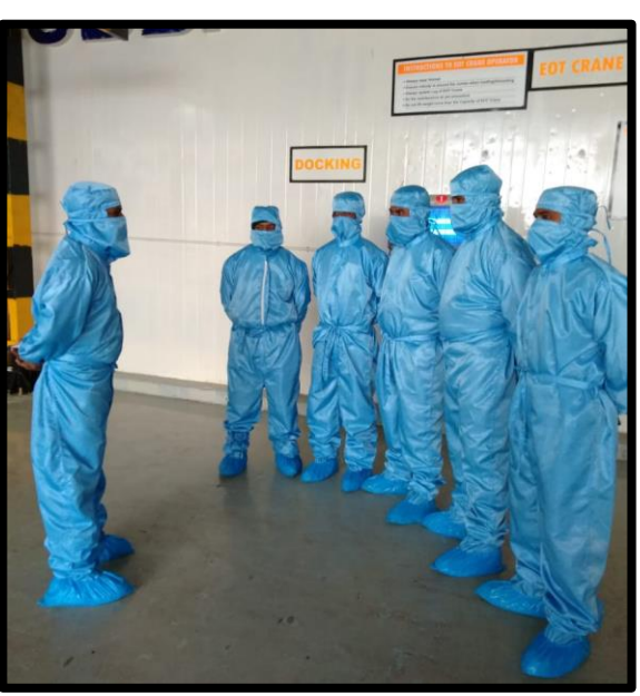
Training MSDS (Material Safety Data Sheet)